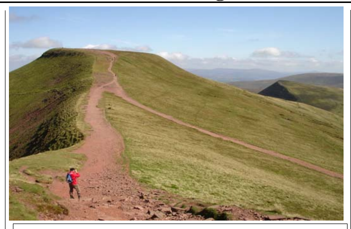
The Beautiful Beacons—what a sight/site to live near!